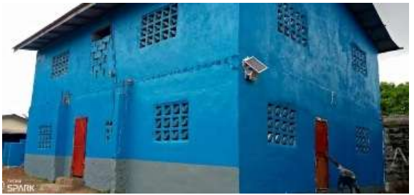
With a scalpel built, exterior plastering began.