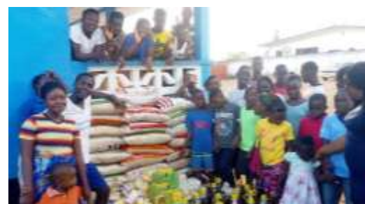
SIC children sending emergency food to rural relatives during COVID outbreak.

In addition to the monthly salaries and stipends totaling $570US that LO/HP, Inc. provides, so much more is given monthly to ensure that everything is provided to meet SIC's needs: daily meals with proper nutrients, clothing, shoes, bedding, hygiene items, toiletries, medicine, and other basic necessities for quality of care, as itemized below: