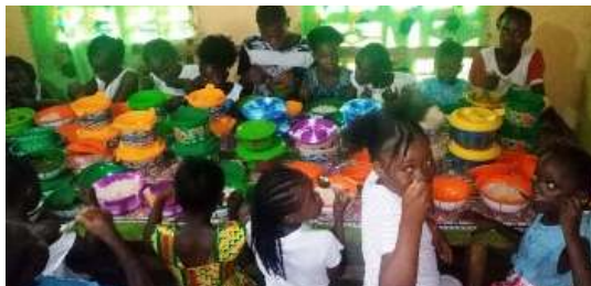
Meals in the Kitchen Building