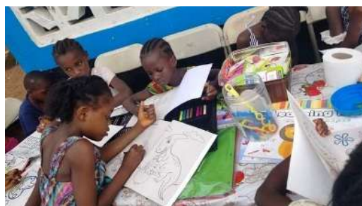
Learning new skills with gifts from America.