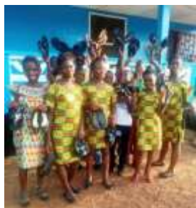
Older girls show off their new shoes.