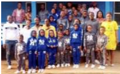
SIC Orphanage Family - Staff: 10 Residents - Males: 10 Females: 19

Many people, churches and civic groups have expressed a sincere interest in helping the poor, but are unable to make a long term or life-time commitment. Let me suggest that you help us by sponsoring SIC for 1 month. Get involved, you won't regret it. The satisfaction in knowing that your gifts provide for their care is immeasurable. Let me share a few pictures of " my adopted family " in Liberia. They can be "your adopted family" too!