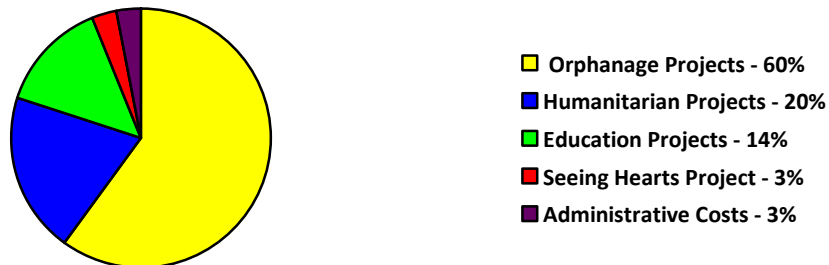
2021 Project Percentages

With overwhelming gratitude, we received $54,025US in donations which was more than doubled our average $25,000US annual donation level. So many compassionate individuals, businesses and churches responded generously to our various appeals through the year. The tremendous increase in donations is especially noteworthy in view of the national decline in expendable income resulting from COVID related job losses, economic uncertainties and budget shortfalls which created challenges for small private-non-profits charities. Because of donors and supporters, LO/HP, Inc. was able to continue providing quality life changing services in all our projects in Liberia and to embrace new ones. We are pleased, once again, to celebrate our all volunteer staff that works tirelessly to support our efforts therefore ensuring a minimum expenditure for administrative costs. Thus, we were able to allocate ninety-three (93%) of all donations to the provision of projects and services to benefit the poor in Liberia. Additional a special thanks to those who provided free office supplies, office space, and paid many months of storage fees for our Operation Blessing Project and other items collected to be sent for distribution to our Liberian projects free of charge.