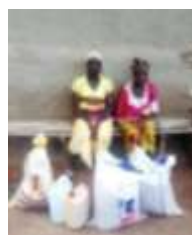
COVID Relief for Rural Villagers