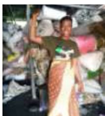
Unwed Mothers Receive Business Start-ups